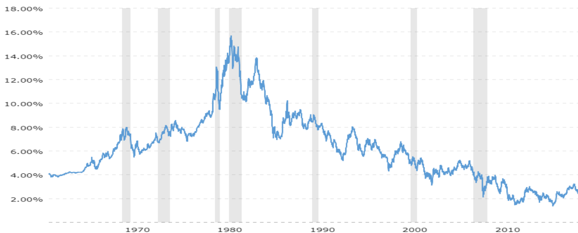
10-Year Treasury Rate—54-Year Historical Chart (1962–2018)

The chart below shows the 10-year treasury rate at 4.08% on January 8, 1962 and moving up to a peak of 14.94% on October 12, 1981. During this dramatic rise in interest rates, bonds produced a return well below the historical average. As previously discussed, bonds have an inverse relationship to interest rates; as interest rates rise, bonds lose value and returns are reduced. As interest rates decrease, bonds will gain value and their returns will increase. Additionally, the bar chart shows that from October 12, 1981 to December 31, 2018 interest rates declined from 14.94% to 2.69%, which caused bonds to generate returns well above their historical returns.